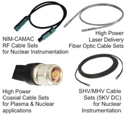
NIM-CAMAC RF Cable Sets for Nuclear Instrumentation