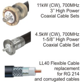
11kW (CW), 700MHz 3" High Power Coaxial Cable Sets