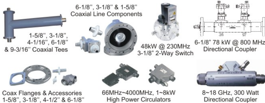
6-1/8", 3-1/8" & 1-5/8" Coaxial Line Components