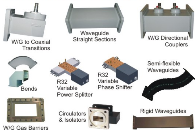
W/G to Coaxial Transitions