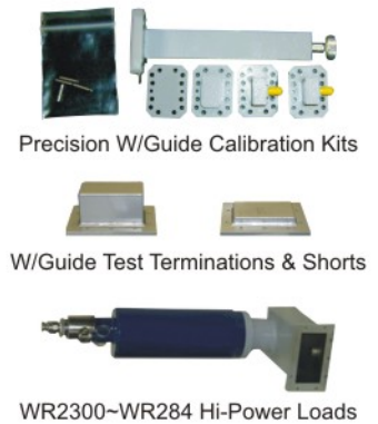
Precision W/Guide Calibration Kits